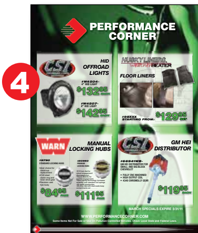
4 WINDOW POSTERS