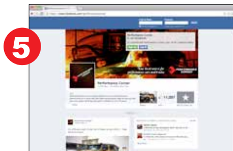
5 SOCIAL MEDIA