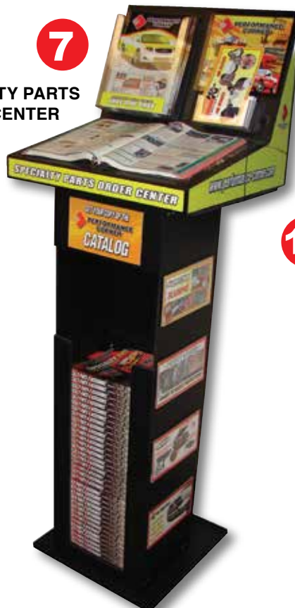
7 SPECIALTY PARTS ORDER CENTER