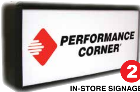
2 IN-STORE SIGNAGE