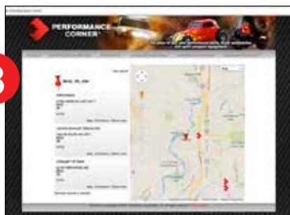
8 DYNAMIC WEBSITE