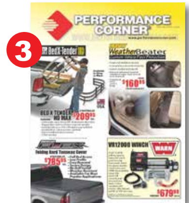
3 RETAIL SALES FLIER