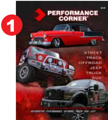
1 FULL COLOR RETAIL CATALOG