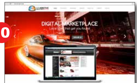
10 DIGITAL MARKETPLACE