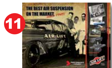
11 BRAND IDENTITY POSTERS